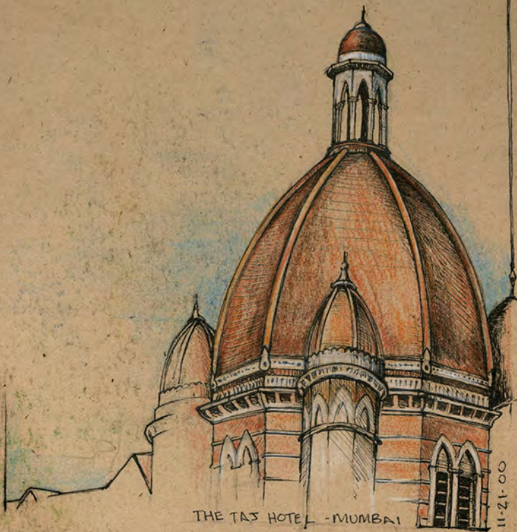
THE TAJ HOTEL - MUMBAI