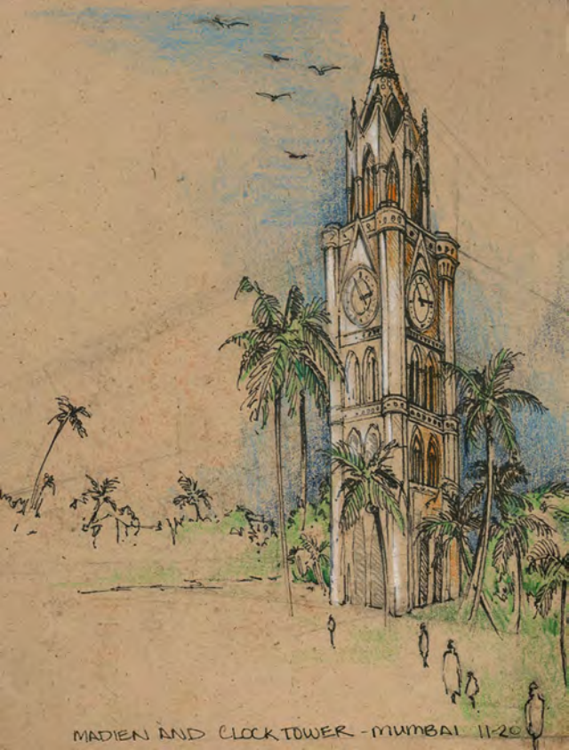
MADIEN AND CLOCK TOWER - MUMBAI 11-20